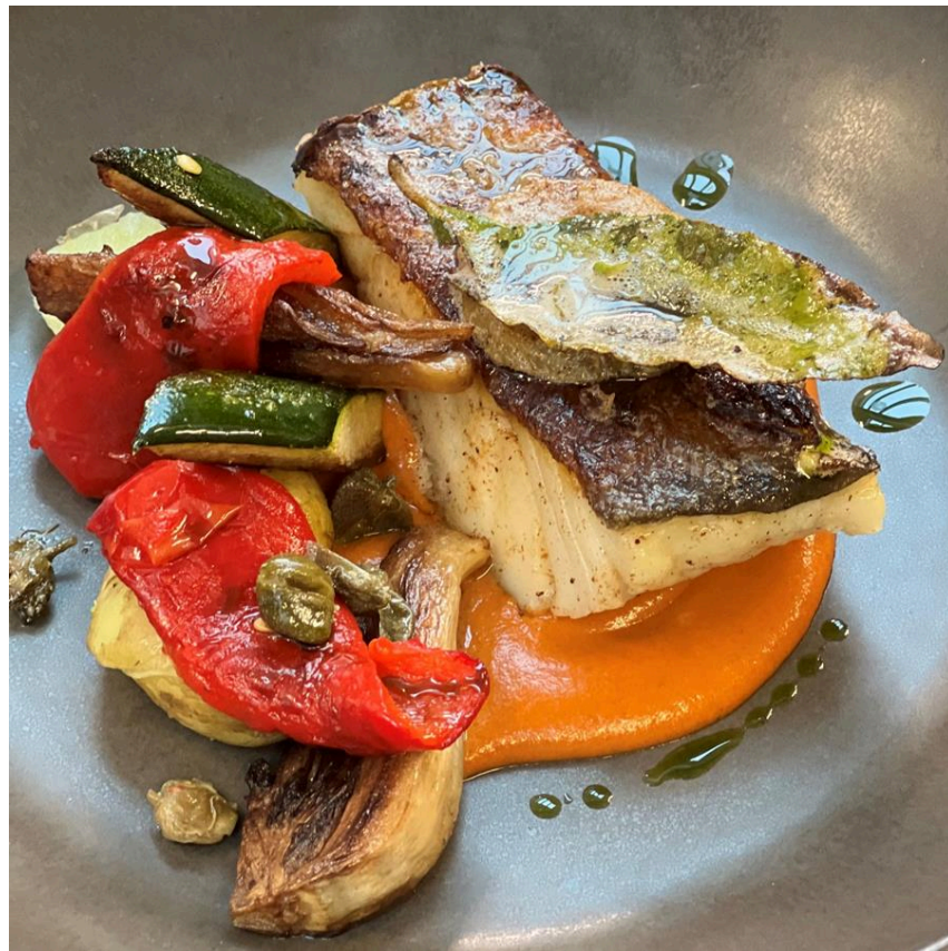
Image: roasted cod with seasonal vegetables

Our summer hours are daily 12-7.30pm for table reservations and 12-8pm for take-away (all our wood-fired pizzas, Fish & Chips and desserts).